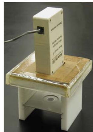
Figure 2. Geiger tube with stand.