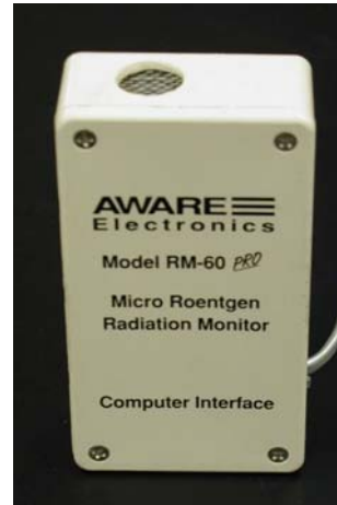
Figure 1. Aware Electronics Model RM-60 Geiger tube.