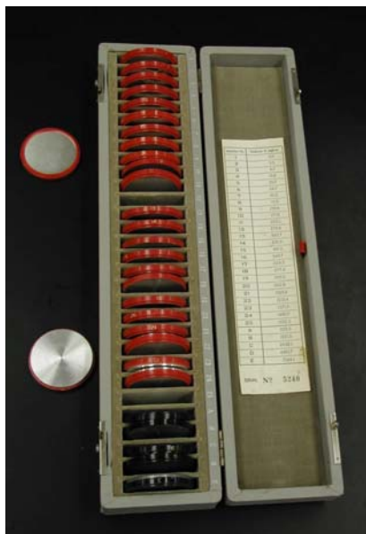
Figure 5. A set of standard shielding materials for radioactivity measurements.

Replace the sheet of shielding material with a thicker sheet. (If using sheets of lead or other metal