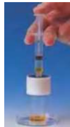
Figure 3. The ^{137}\text{Cs}/^{137}\text{Ba} Isogenerator

Where: A_t is the activity (counts per minute) at some time t A_0 is the activity at time 0 (initial activity) t is the time in minutes k is the decay constant