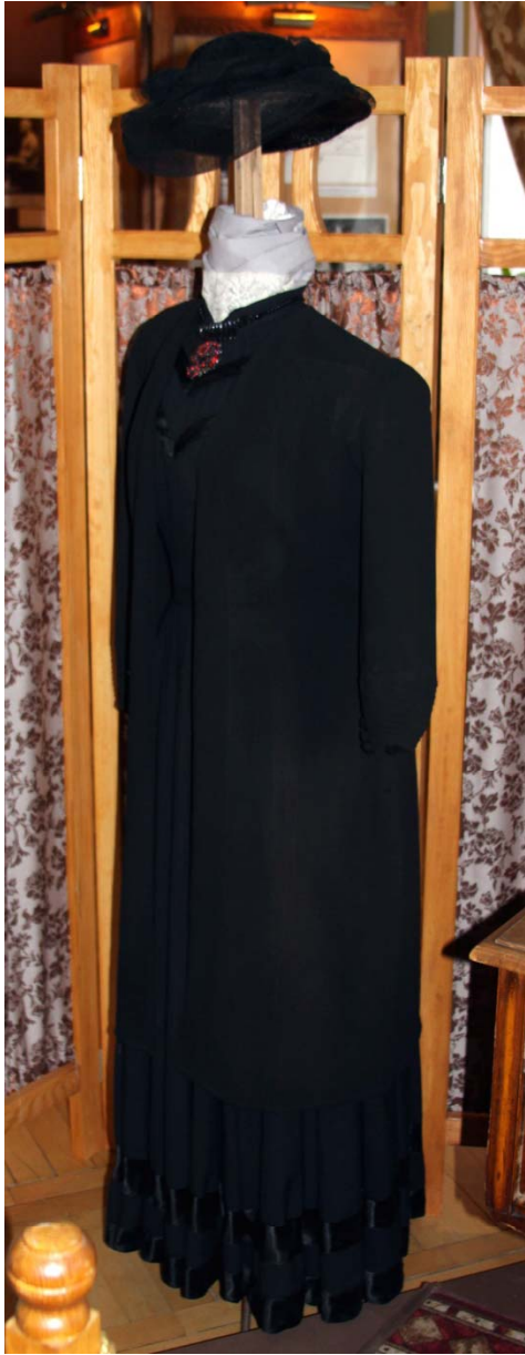
Marie Curie's cloak and hat and desk