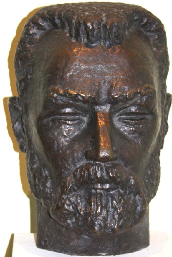
Plon-bur Z Wolske