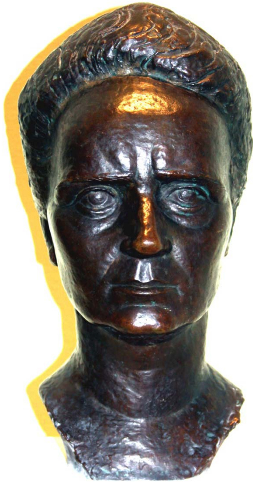
Gen. Skrodzinski-Curie - Miedzowa